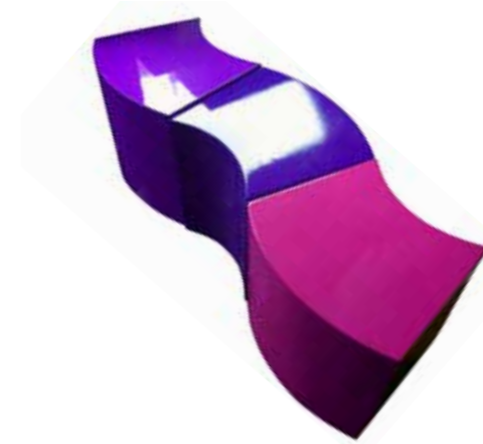
3 x WAVEST01