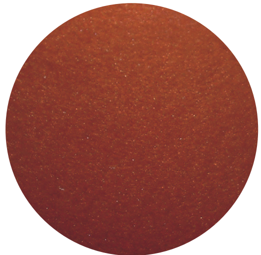
Polished Metallic Copper