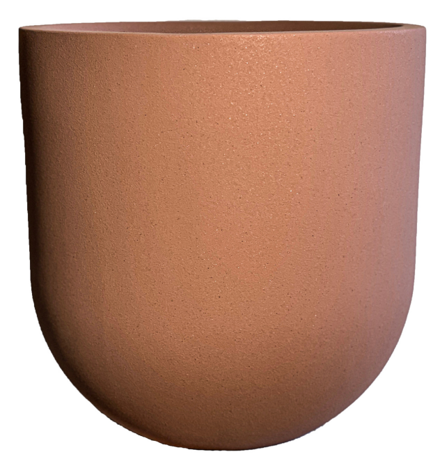
Light Red Stone