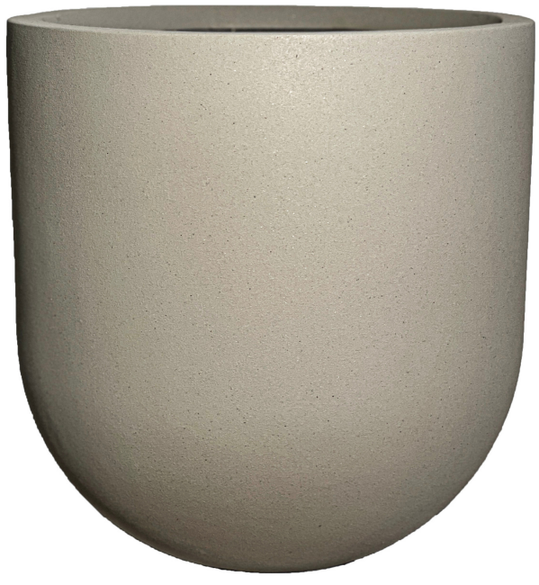
Mid White Stone