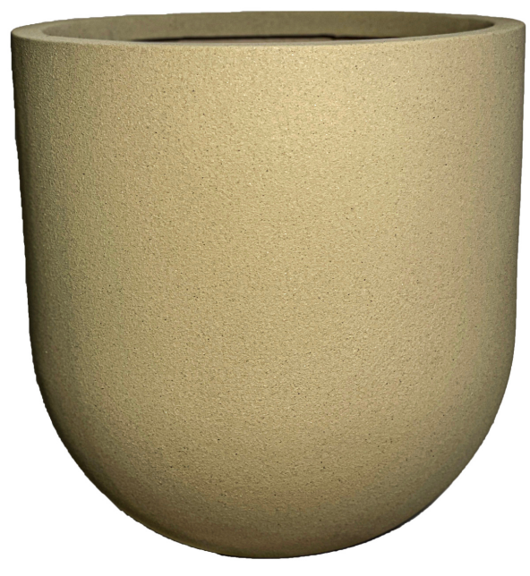
Light Yellow Stone