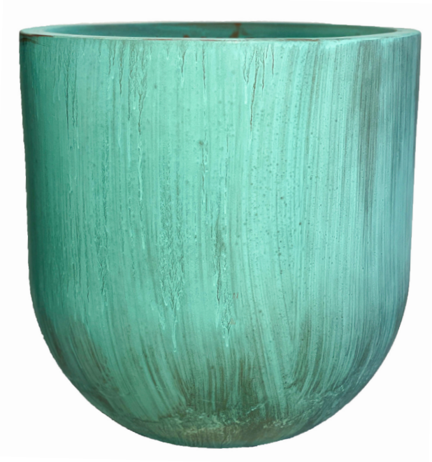
Verdigris / Copper Blue