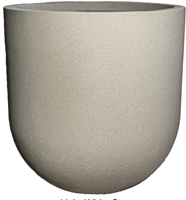
Light White Stone