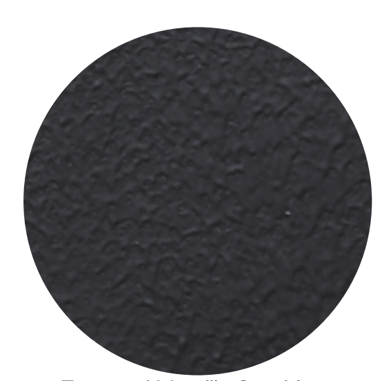
Textured Metallic Graphite