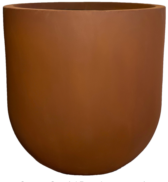
Corten Steel / Rust Lacquered