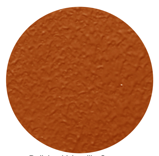
Polished Metallic Copper