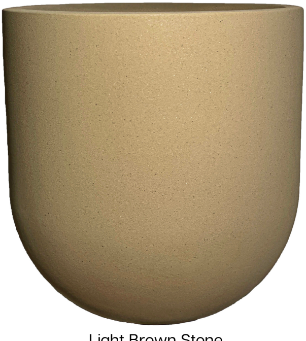
Light Brown Stone