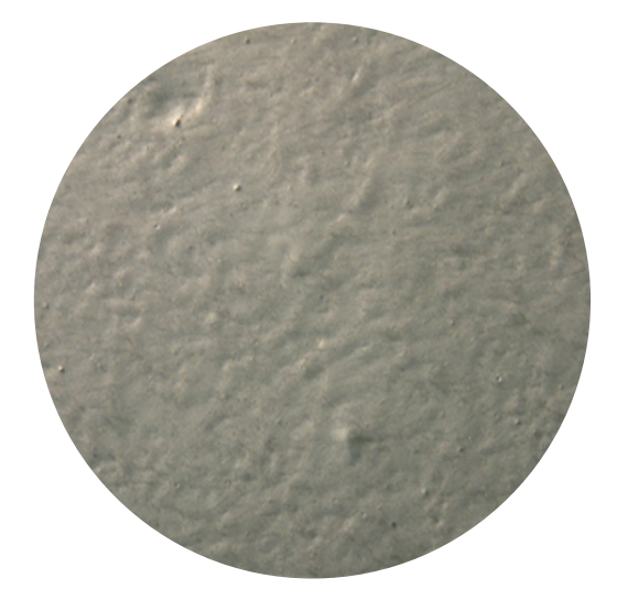
Textured Metallic Silver