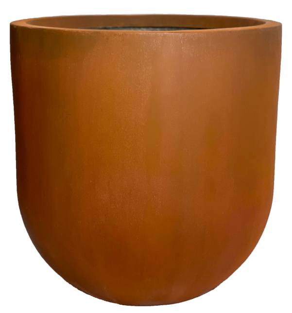
Corten Steel / Rust