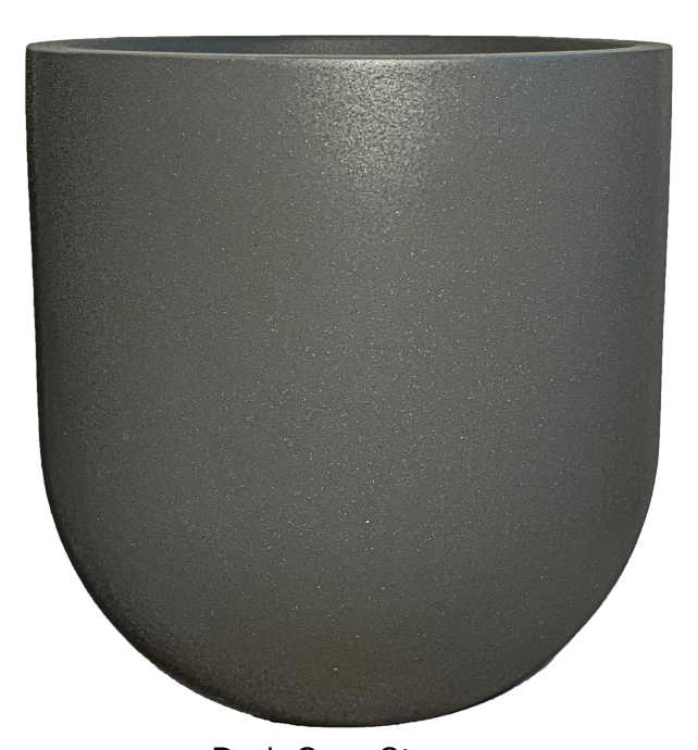
Dark Grey Stone