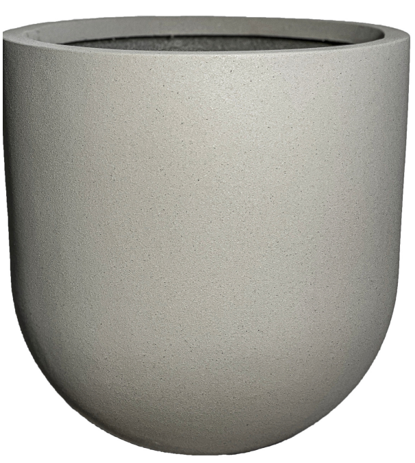
Light Grey Stone