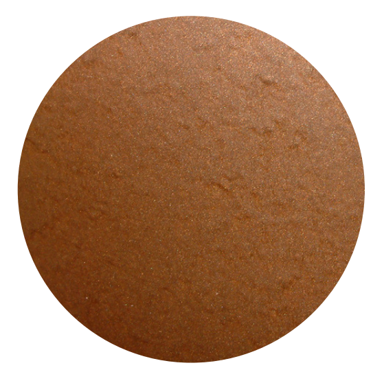
Textured Metallic Bronze