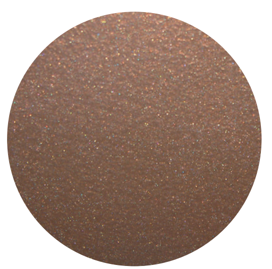
Polished Metallic Bronze