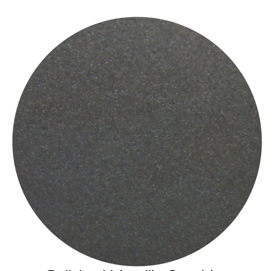
Polished Metallic Graphite